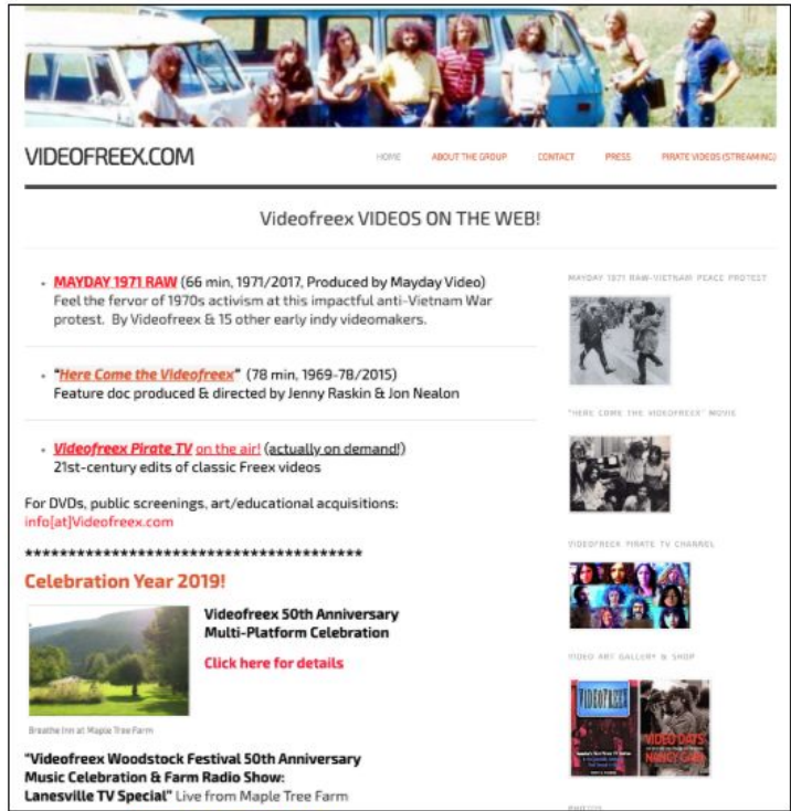
BRANCHES: www.Videofreex.com posted on world-wide web & emailed 2019

Thirty-page illustrated report compares Videofreex and early indy video, a 1970s leading edge medium, with contemporary digital media and current indy production groups. Co-authored by five Videofreex, other early videomakers, and younger activist mediamakers, during a two-day convening. Archived on the web and at the Hunter, Phoenicia and Mountain Top (Tannersville) Public Libraries, Mountain Top Historical Society and NYSCA.