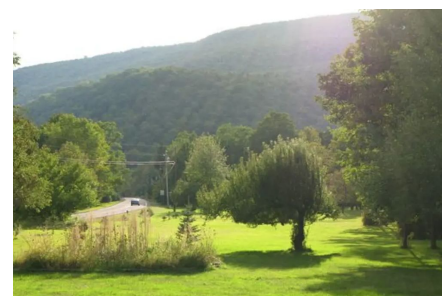
Sun sets at Maple Tree Farm

Videofreex archive - In Motion Productions NYC studio